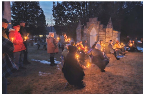
Candlelight vigil at the Old Cemetery.