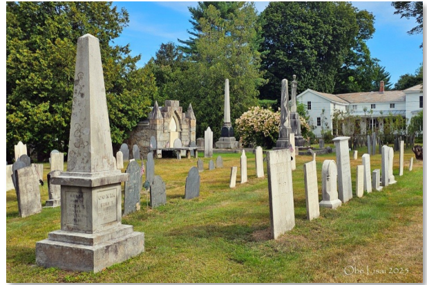
The front row, visible from the Route 5, now shines.