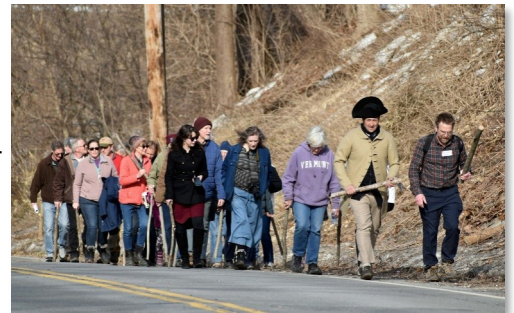
Walking up Court-house Hill.

The WHS maintains the Town Hall Museum, the Bradley Law Office nearby, and an Archives room in the Westminster Institute. In winter, there are no public hours, but the WHS is always a community resource. Please contact us through WestminsterVtHistory.org with any sort of question about Westminster's rich history.